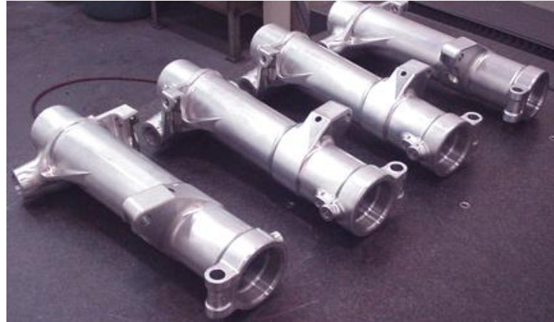
Aerospace and Defense