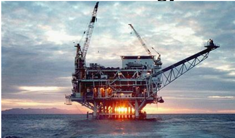
Chemical & Petroleum Processing