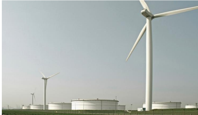
Solar and Wind Energy